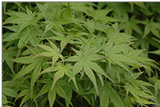
Beni Tsukasa Japanese Maple foliage

Beni Tsukasa Japanese Maple is recommended for the following landscape applications;