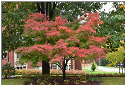
Beni Tsukasa Japanese Maple in fall