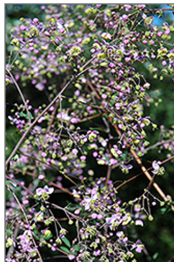
Rochebrun Meadow Rue flowers