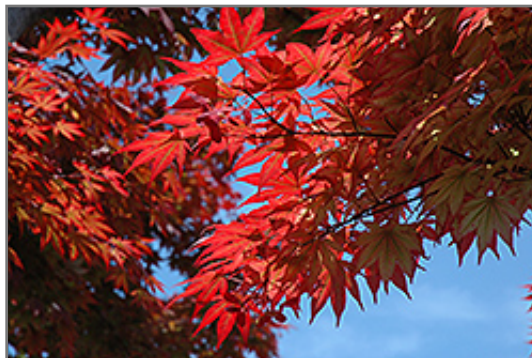
Oshio Beni Japanese Maple foliage

This tree does best in full sun to partial shade. You may want to keep it away from hot, dry locations that receive direct afternoon sun or which get reflected sunlight, such as against the south side of a white wall. It prefers to grow in average to moist conditions, and shouldn't be allowed to dry out. It is not particular as to soil pH, but grows best in rich soils. It is somewhat tolerant of urban pollution, and will benefit from being planted in a relatively sheltered location. Consider applying a thick mulch around the root zone in winter to protect it in exposed locations or colder microclimates. This is a selected variety of a species not originally from North America.