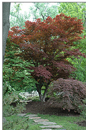
Oshio Beni Japanese Maple