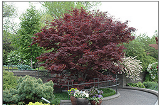
Bloodgood Japanese Maple

Bloodgood Japanese Maple is recommended for the following landscape applications;