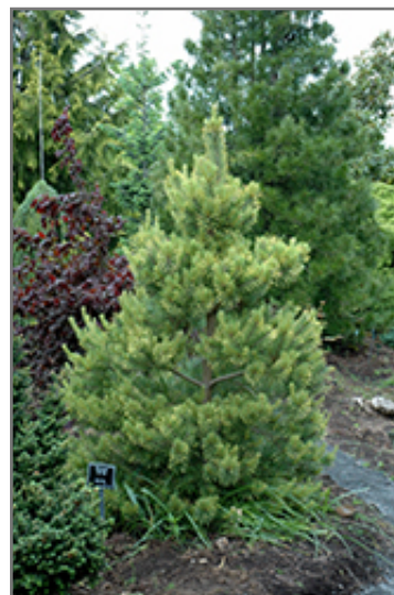
Gold Coin Scotch Pine

Gold Coin Scotch Pine is a multi-stemmed evergreen tree with a more or less rounded form. Its average texture blends into the landscape, but can be balanced by one or two finer or coarser trees or shrubs for an effective composition.