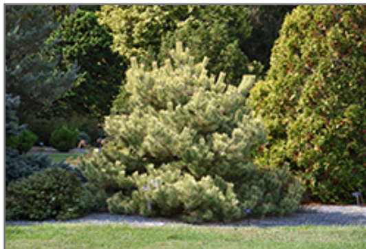
Gold Coin Scotch Pine

This tree should only be grown in full sunlight. It prefers dry to average moisture levels with very well-drained soil, and will often die in standing water. It is considered to be drought-tolerant, and thus makes an ideal choice for xeriscaping or the moisture-conserving landscape. It is not particular as to soil type or pH. It is highly tolerant of urban pollution and will even thrive in inner city environments. This is a selected variety of a species not originally from North America.