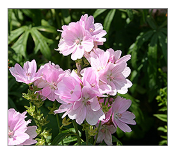
Little Princess Prairie Mallow flowers