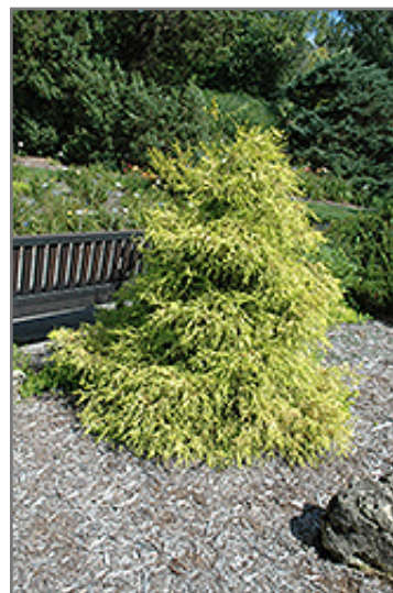
Lemon Thread Falsecypress

Lemon Thread Falsecypress is recommended for the following landscape applications;