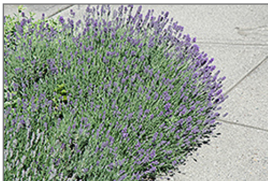
Munstead Lavender in bloom