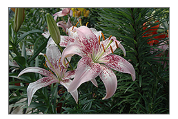
Dot Com Lily flowers

Plant Height: 24 inches Flower Height: 32 inches Spread: 12 inches Spacing: 10 inches Sunlight: O O Hardiness Zone: 3a Group/Class: Asiatic Hybrid