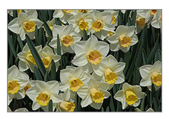
Salome Daffodil flowers