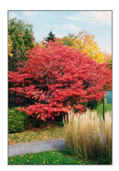
Shadblow Serviceberry in fall

Shadblow Serviceberry is a multi-stemmed deciduous shrub with an upright spreading habit of growth. Its average texture blends into the landscape, but can be balanced by one or two finer or coarser trees or shrubs for an effective composition.