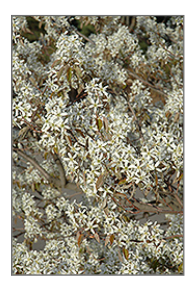
Shadblow Serviceberry flowers

This shrub does best in full sun to partial shade. It is quite adaptable, prefering to grow in average to wet conditions, and will even tolerate some standing water. It is not particular as to soil type or pH. It is somewhat tolerant of urban pollution. This species is native to parts of North America.