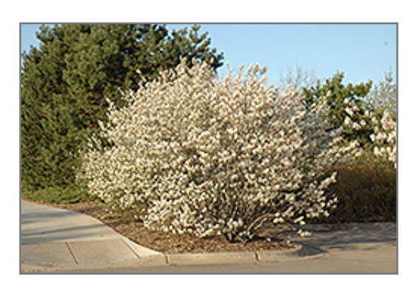
Shadblow Serviceberry in bloom

A naturally beautiful small tree, ideal for small home landscapes; masses of showy white flowers in spring, edible berries in June, and amazing fall color add up to a versatile landscape plant