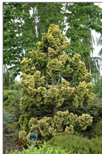
Dwarf Golden Hinoki Falsecypress