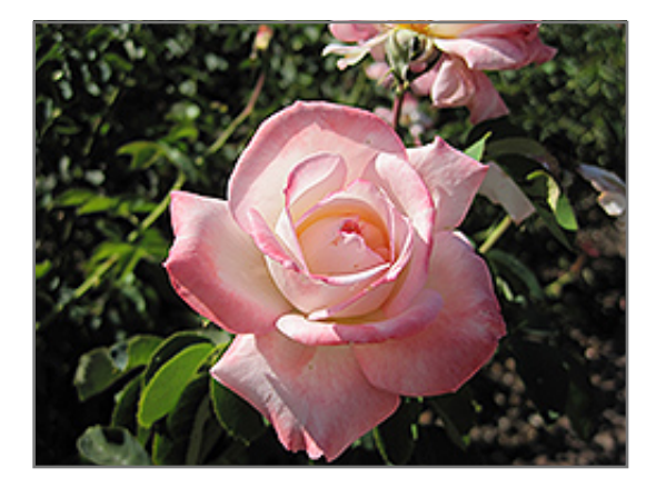
Secret Rose flowers