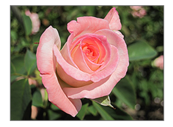
Secret Rose flowers