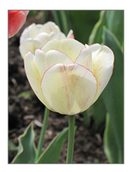
Shirley Tulip in bloom