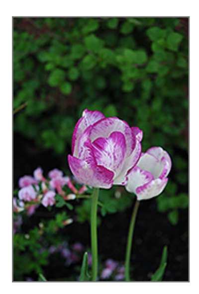
Shirley Tulip flowers