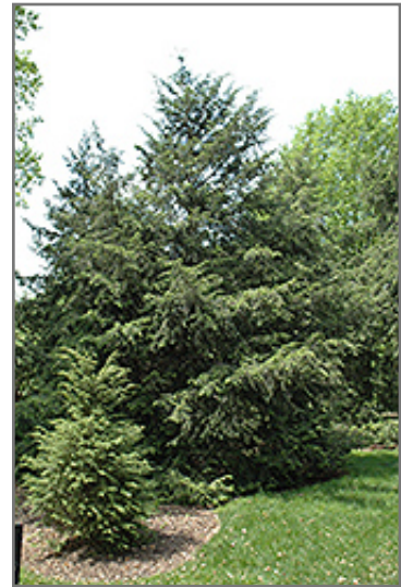
Canadian Hemlock

Canadian Hemlock is recommended for the following landscape applications;