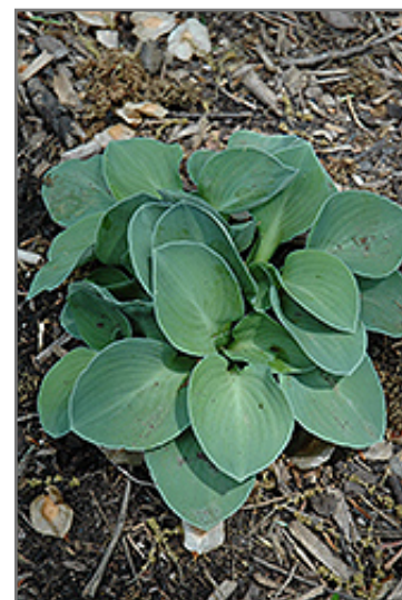
Blue Mouse Ears Hosta