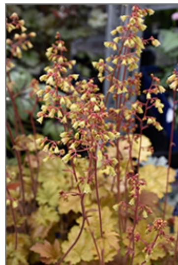
Ginger Ale Coral Bells foliage

Ginger Ale Coral Bells is a fine choice for the garden, but it is also a good selection for planting in outdoor pots and containers. It is often used as a 'filler' in the 'spiller-thriller-filler' container combination, providing a mass of flowers and foliage against which the larger thriller plants stand out. Note that when growing plants in outdoor containers and baskets, they may require more frequent waterings than they would in the yard or garden.