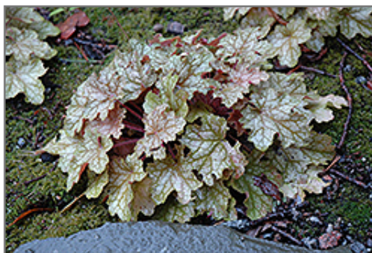
Ginger Ale Coral Bells