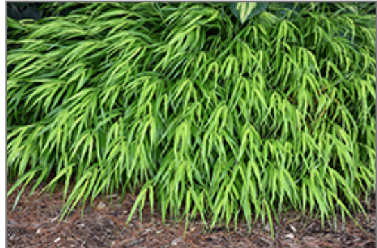
All Gold Hakone Grass foliage

All Gold Hakone Grass is recommended for the following landscape applications;