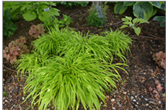
All Gold Hakone Grass