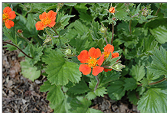
Boris Avens flowers

Boris Avens is recommended for the following landscape applications;