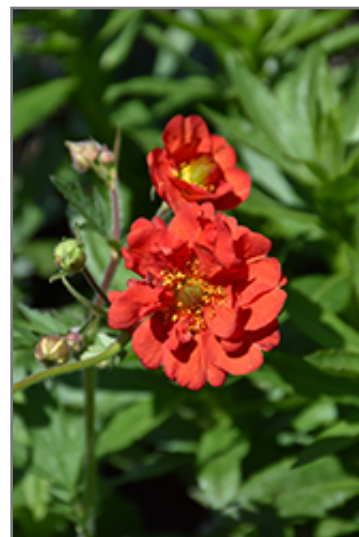
Blazing Sunset Avens flowers

Blazing Sunset Avens is recommended for the following landscape applications;