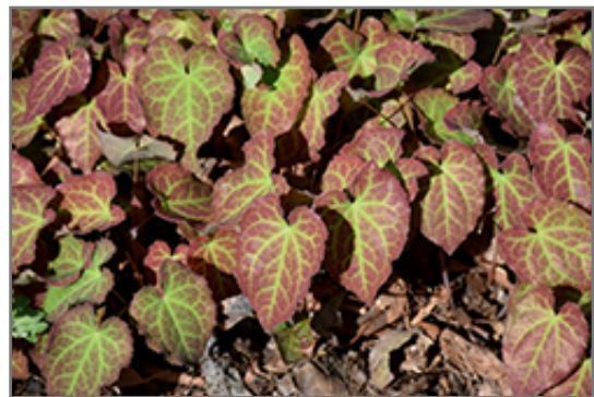
Froehnleiten Bishop's Hat foliage