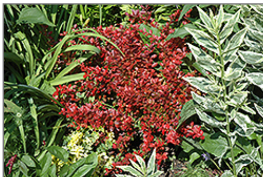
Cherry Bomb Japanese Barberry