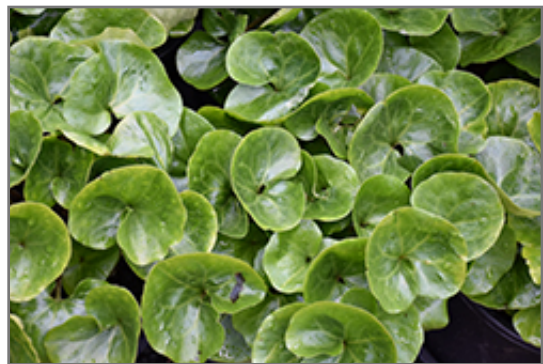
European Wild Ginger foliage