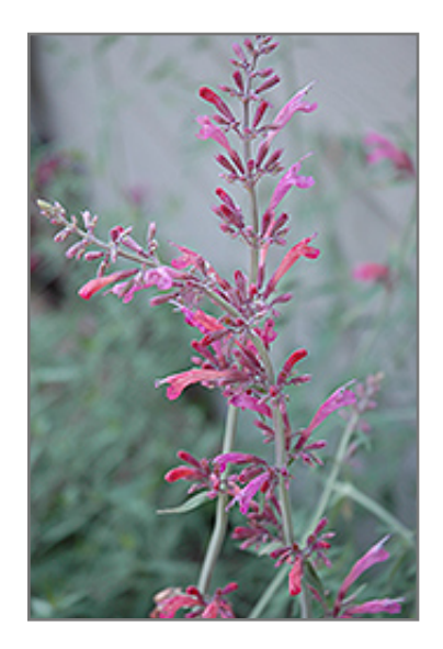
Desert Sunrise Hyssop flowers

This no-fail perennial provides long lasting color going into the fall; its tubular pink flowers with hints of orange attracts hummingbirds, clumping habit restrains it from spreading too fast