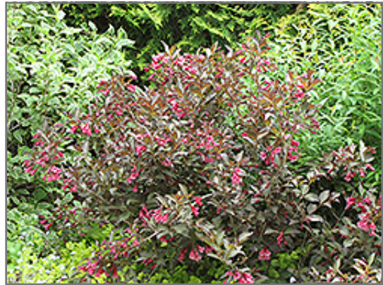
Midnight Wine Weigela in bloom

Midnight Wine Weigela is recommended for the following landscape applications;