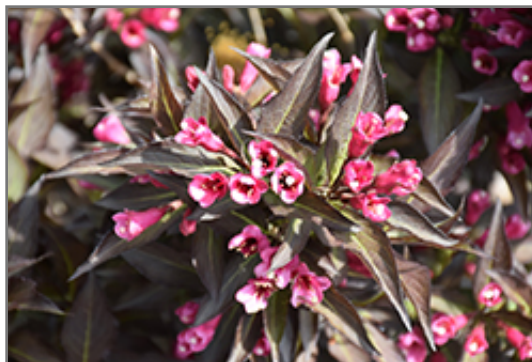
Midnight Wine Weigela flowers