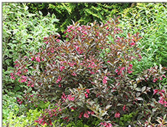
Midnight Wine Weigela in bloom

Midnight Wine Weigela is recommended for the following landscape applications;