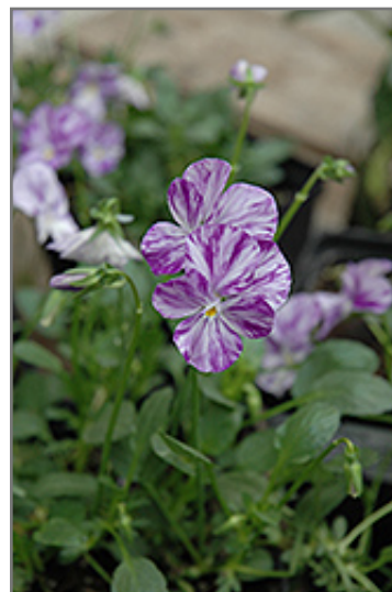
Rebecca Pansy flowers

Rebecca Pansy is recommended for the following landscape applications;