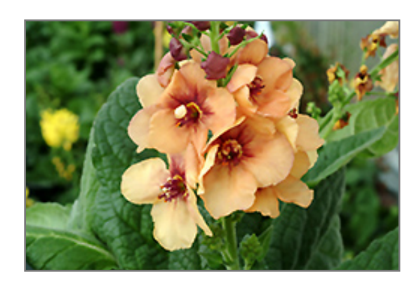
Sierra Sunset Mullein flowers

Plant Height: 8 inches Flower Height: 18 inches Spread: 14 inches Spacing: 10 inches Sunlight: O Hardiness Zone: 6a