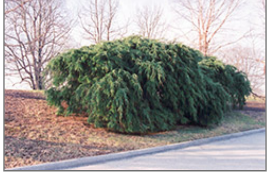
Sargent's Weeping Hemlock

A fine evergreen shrub, tall growing and wide spreading with gracefully pendulous branches and fine textured foliage, an unforgettable sight; best used as a solitary specimen; needs organic, acidic soil, adequate moisture and shelter from drying winds