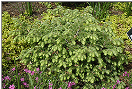
Moon Frost Hemlock

Moon Frost Hemlock is recommended for the following landscape applications;