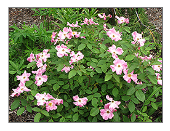
Rugosa Rose in bloom