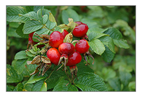
Rugosa Rose fruit

Rugosa Rose will grow to be about 5 feet tall at maturity, with a spread of 7 feet. It tends to fill out right to the ground and therefore doesn't necessarily require facer plants in front, and is suitable for planting under power lines. It grows at a fast rate, and under ideal conditions can be expected to live for approximately 25 years.