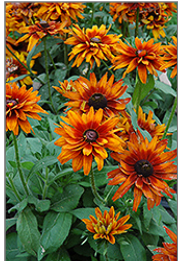
Cherokee Sunset Coneflower flowers

Cherokee Sunset Coneflower is recommended for the following landscape applications;