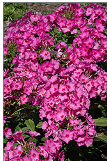
Flame Pink Garden Phlox flowers