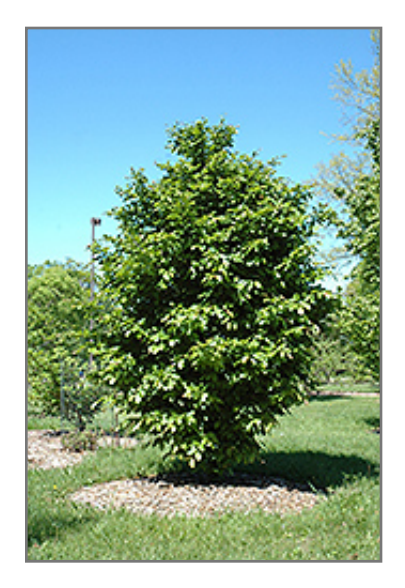
Vanessa Parrotia

This is a relatively low maintenance shrub, and should not require much pruning, except when necessary, such as to remove dieback. It has no significant negative characteristics.