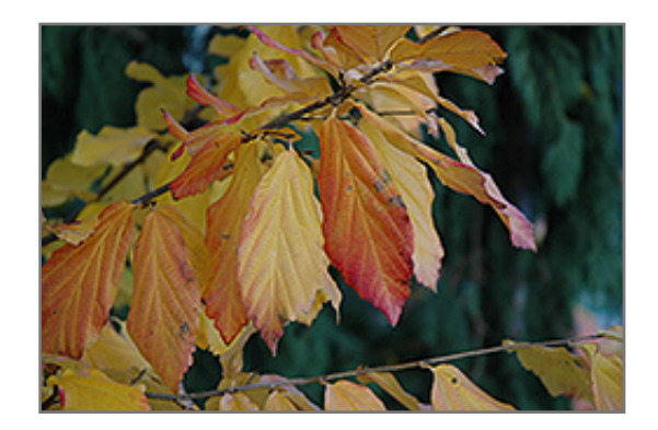
Vanessa Parrotia in fall

Vanessa Parrotia is recommended for the following landscape applications;