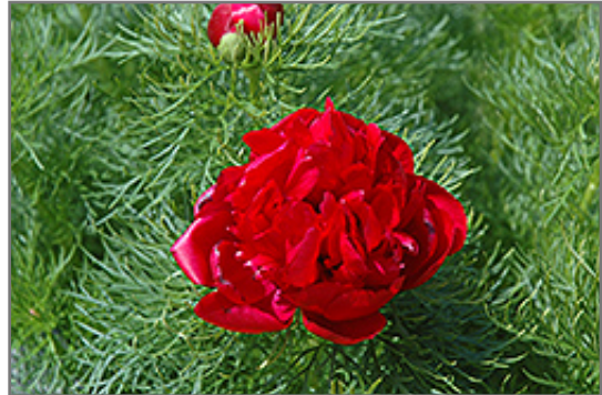
Double Fernleaf Peony flowers