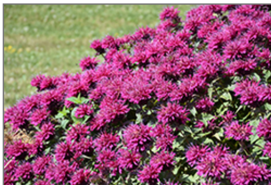
Grand Marshall Beebalm flowers