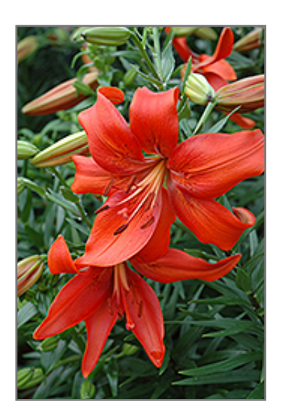
Red Tiger Lily flowers

Red Tiger Lily features bold nodding scarlet trumpet-shaped flowers with black spots at the ends of the stems in mid summer. The flowers are excellent for cutting. Its narrow leaves remain green in colour throughout the season.