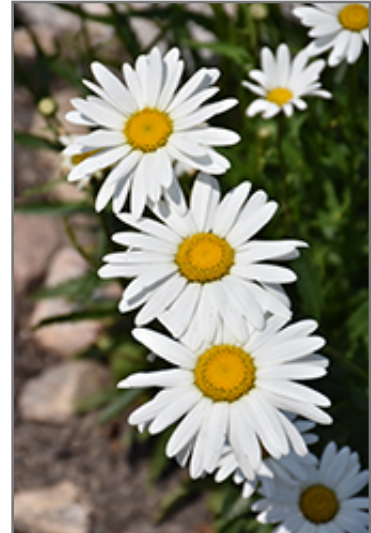
Silver Princess Shasta Daisy flowers