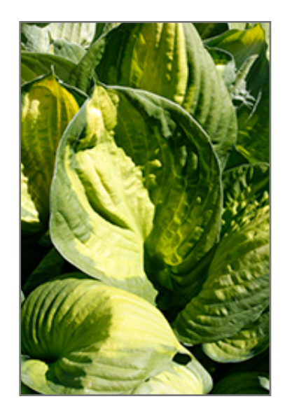
Captain Kirk Hosta foliage