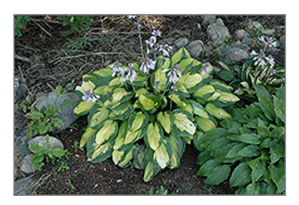
Captain Kirk Hosta in bloom

Captain Kirk Hosta will grow to be about 20 inches tall at maturity extending to 32 inches tall with the flowers, with a spread of 30 inches. When grown in masses or used as a bedding plant, individual plants should be spaced approximately 26 inches apart. Its foliage tends to remain dense right to the ground, not requiring facer plants in front. It grows at a medium rate, and under ideal conditions can be expected to live for approximately 10 years. As an herbaceous perennial, this plant will usually die back to the crown each winter, and will regrow from the base each spring. Be careful not to disturb the crown in late winter when it may not be readily seen!