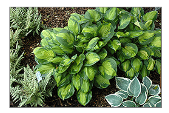
Captain Kirk Hosta

This is a relatively low maintenance plant, and is best cleaned up in early spring before it resumes active growth for the season. Gardeners should be aware of the following characteristic(s) that may warrant special consideration;