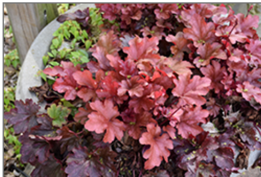
Peach Flambe Coral Bells