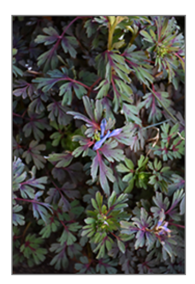
Purple Leaf Corydalis flowers