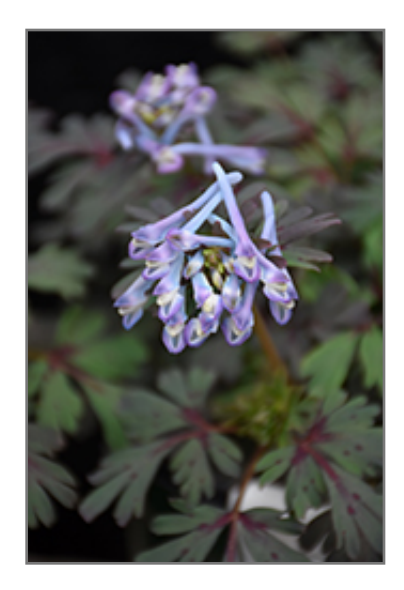
Purple Leaf Corydalis flowers

Purple Leaf Corydalis is recommended for the following landscape applications;