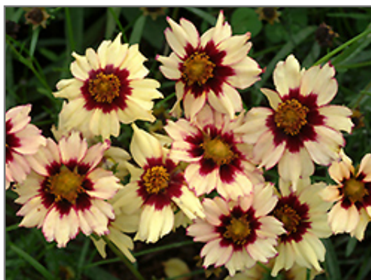
Autumn Blush Tickseed flowers