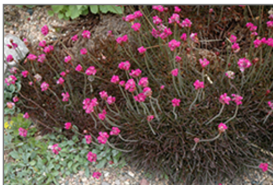
Red-leaved Sea Thrift in bloom