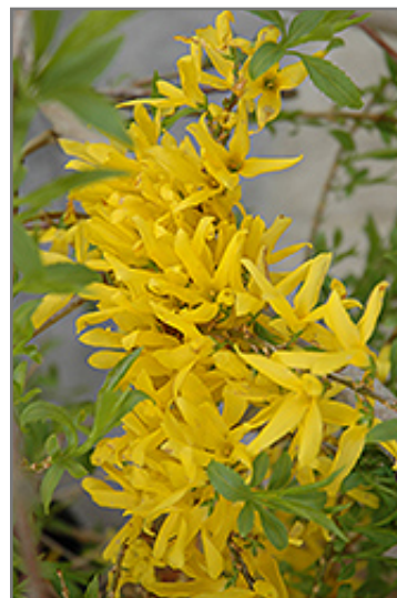
Gold Tide Forsythia flowers

Gold Tide Forsythia is recommended for the following landscape applications;