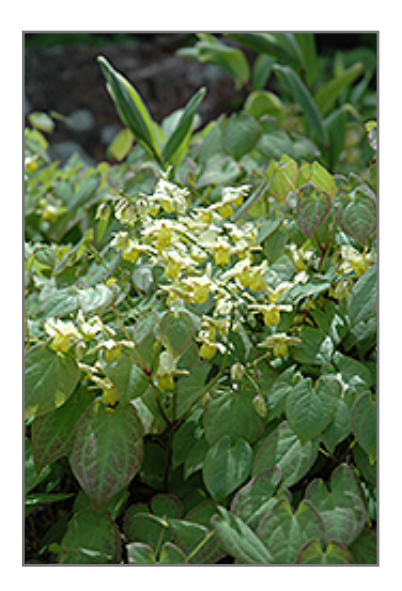
Yellow Barrenwort flowers

Delicate shooting star-like lemon yellow flowers; heart-shaped green leaves have reddish overtones in spring and fall; makes a great groundcover that is tolerant of dry shade once established; also grows well in moisture if well-drained