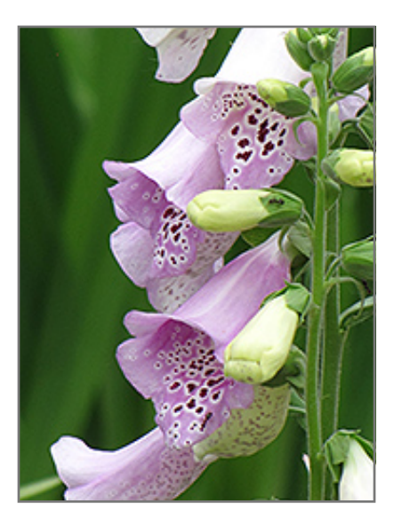
Camelot Lavender Foxglove flowers