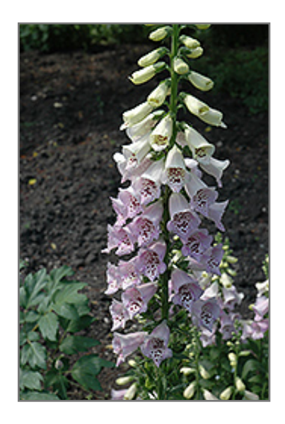
Camelot Lavender Foxglove flowers

This plant will require occasional maintenance and upkeep, and is best cleaned up in early spring before it resumes active growth for the season. It is a good choice for attracting butterflies and hummingbirds to your yard, but is not particularly attractive to deer who tend to leave it alone in favor of tastier treats. Gardeners should be aware of the following characteristic(s) that may warrant special consideration;