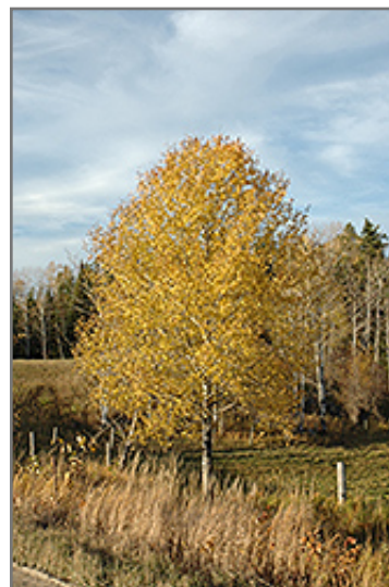
Trembling Aspen in fall

This tree should only be grown in full sunlight. It is an amazingly adaptable plant, tolerating both dry conditions and even some standing water. It is considered to be drought-tolerant, and thus makes an ideal choice for xeriscaping or the moisture-conserving landscape. It is not particular as to soil type or pH. It is quite intolerant of urban pollution, therefore inner city or urban streetside plantings are best avoided. This species is native to parts of North America.