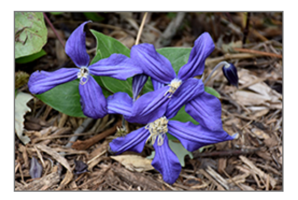
Durand Hybrid Clematis flowers

An heirloom variety of clematis that's showy to a fault, with its abundant deep blue flowers and prominent yellow centers, one of the deepest and darkest colors available in a clematis