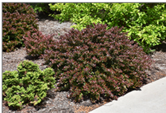
Concorde Japanese Barberry