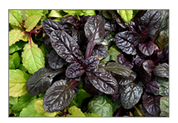
Feathered Friends Fierce Falcon Bugleweed foliage

Feathered Friends Fierce Falcon Bugleweed is recommended for the following landscape applications;