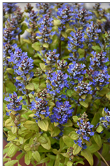
Feathered Friends Fancy Finch Bugleweed flowers

Feathered Friends Fancy Finch Bugleweed is a dense herbaceous evergreen perennial with a ground-hugging habit of growth. Its relatively fine texture sets it apart from other garden plants with less refined foliage.